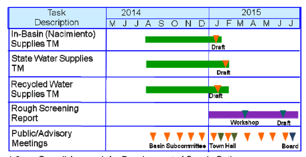
Figure 1.2 Overall Approach for Development of Supply Options

The proposed schedule is subject to change. The Supply Options Study is highly dependent on the availability of District management and staff, as well as the management and staff of the agencies involved, to provide information and review draft deliverables.