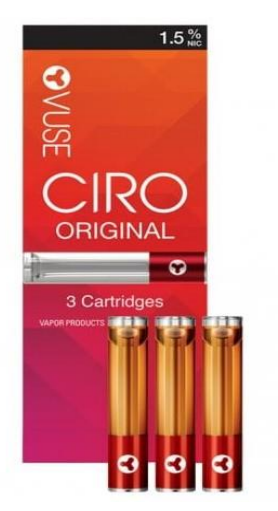
Vuse Ciro Power Unit