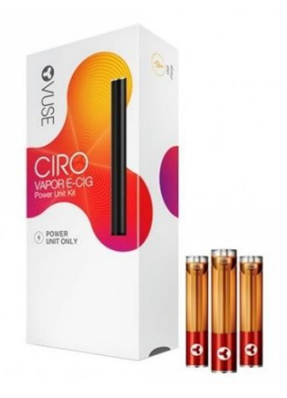
Vuse Ciro Power Unit