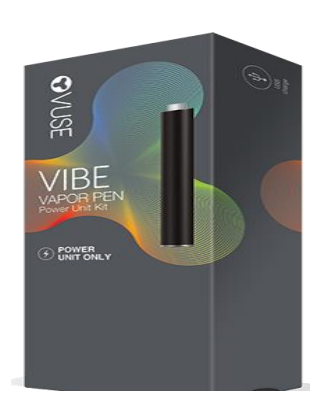
Vuse Vibe Power Unit