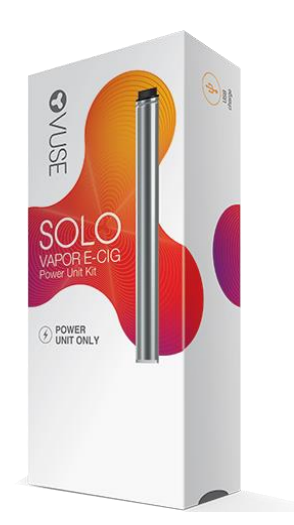
Vuse Solo Power Unit