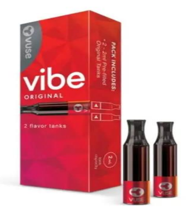
Vuse Vibe Tank Original 3% Nicotine