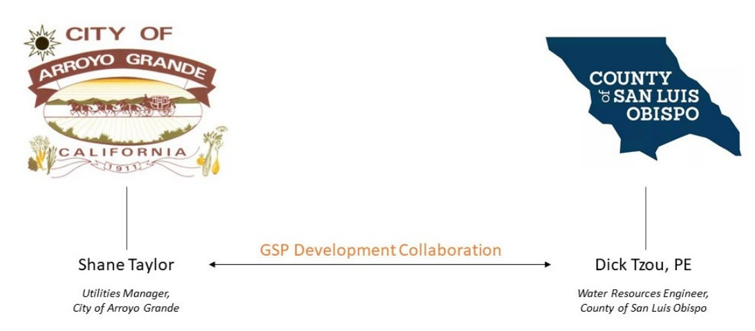
Figure 2-2: GSA Staff Representatives

The MOA establishes the terms under which the City GSA and County GSA will jointly develop a single GSP. No other participating parties will be involved explicitly in the develop of the GSP. City and County staff will collaboratively participate in developing a GSP through, among other things, providing guidance to consultant and engaging AG Subbasin users and stakeholders. Once the GSP is developed, it will be considered for adoption by the GSAs (i.e., City Council and County Board of Supervisors) and subsequently submitted to DWR for approval. The organization and management structures of each of the Parties are described in the following sections. The MOA does not specify the appointment of officer positions. However, Figure 2-2 shows the names of the appointed GSA staff representatives and depicts the relationship of the GSAs and the overall governance structure for developing the GSP: