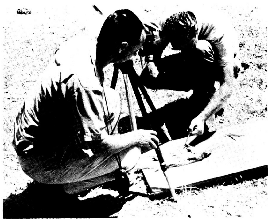
Cooperative project with Cal Poly developing educational material on ground squirrel