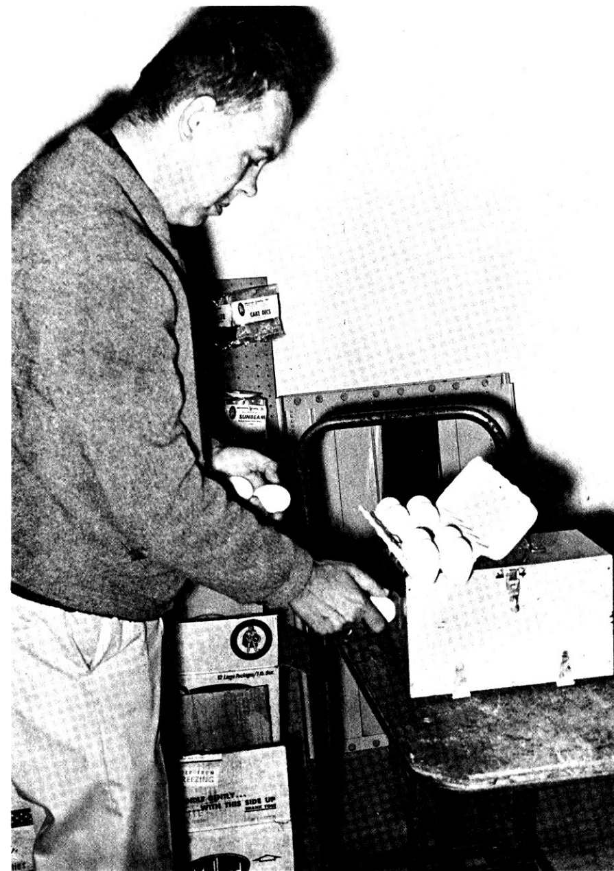
Candling eggs in retail stores to insure quality eggs for consumers.