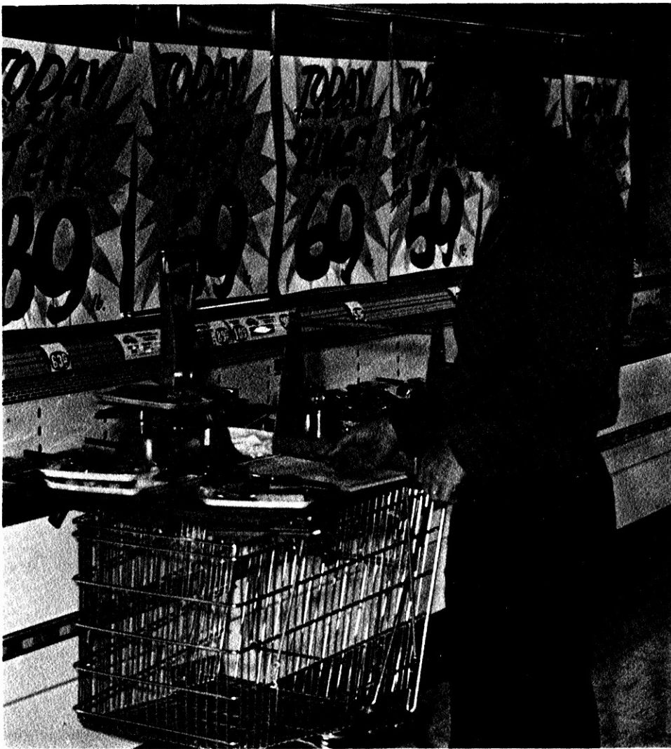
Checking accuracy of weights and prices of prepackaged meats by Weights and Measures Personnel.