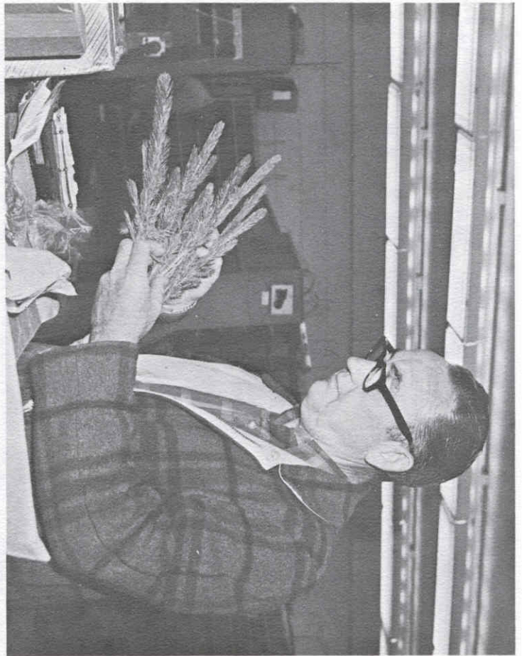
Inspecting incoming plant material for compliance with quarantine regulations.