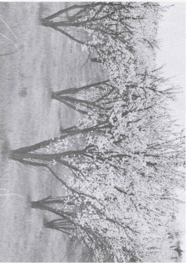
Established dryland almond orchard in blossom