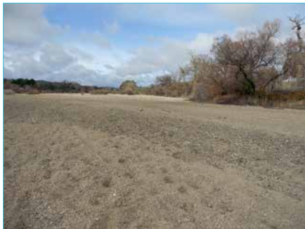
Recent picture by stakeholder in Paso Robles Basin shows that the Salinas River is dry due to the current drought.

As further described in this joint effort proposal, the Basin Study partners are actively engaged in pursuing sustainable practices in accordance of with the requirements of the State's Groundwater Sustainability Act (SGMA). Together, the partners are developing plans for sustainable groundwater management in the basins. The partners have implemented changes in conjunctive use programs to improve steelhead recovery and we participate in one another's operating and public outreach committees. The partners are dedicated to pursuing and evaluating the challenges of water resource management so that together, along with decision makers, they will collectively ensure future generations are provided with the tools to adapt to available water supplies and demand in proactive and responsible measures.