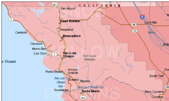
Figure 1 This map demonstrates the areas of coverage for the Medical Reserve Corps. Surrounding counties may be served upon mutual aid request.