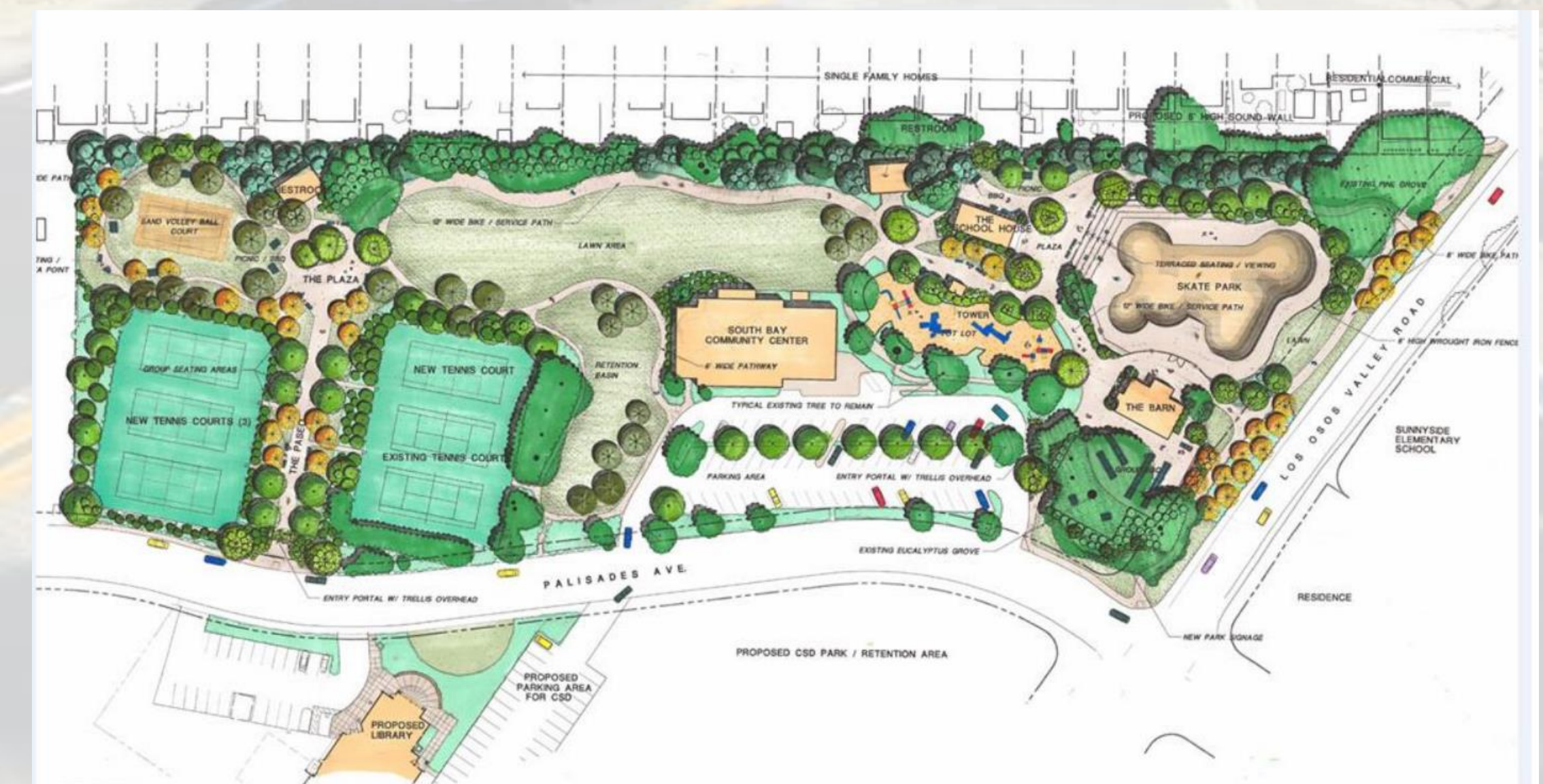
Community Projects (Los Osos Parks Master Plan)