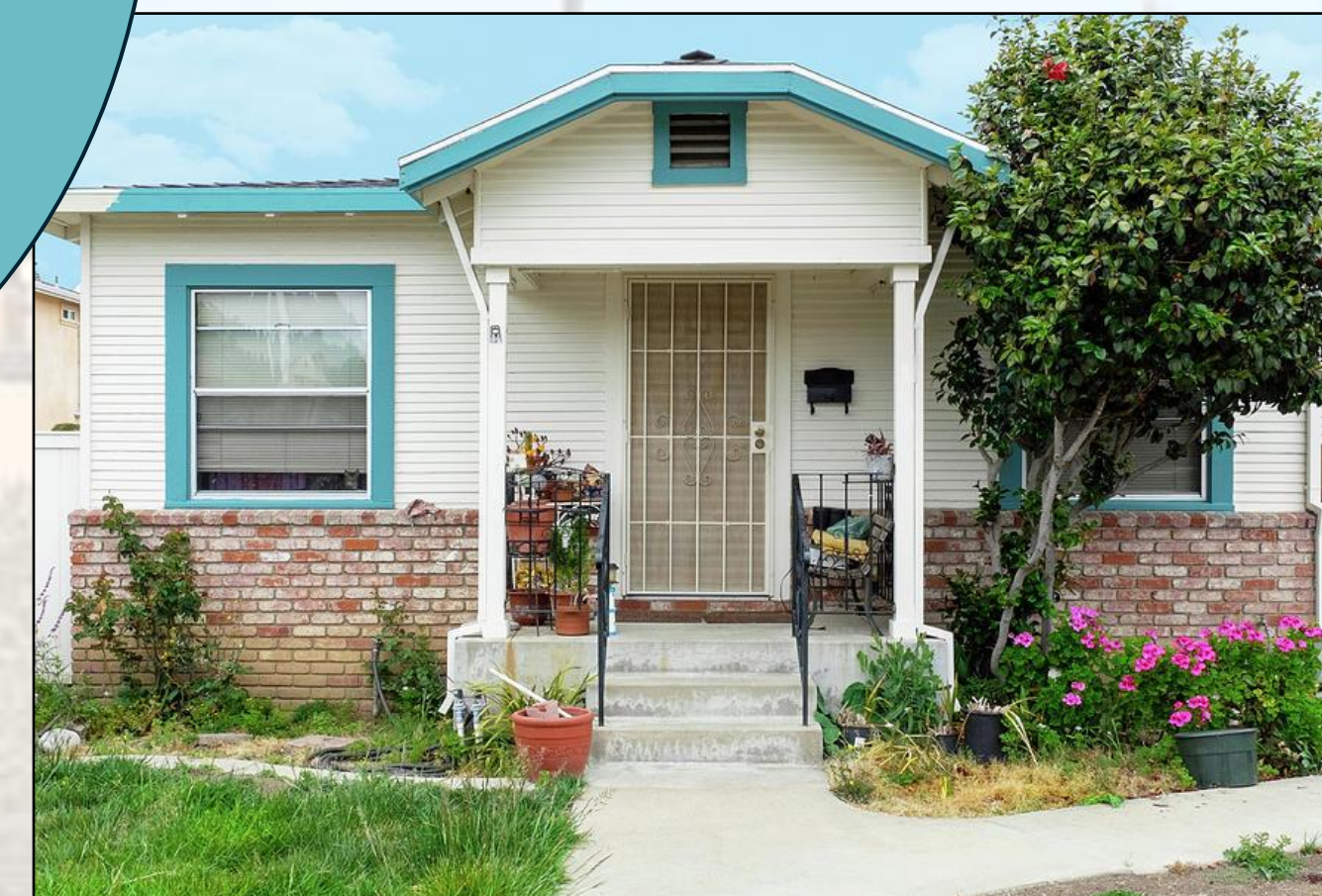
Infill Development (Vacant and Redevelopment for Residential and Commercial)