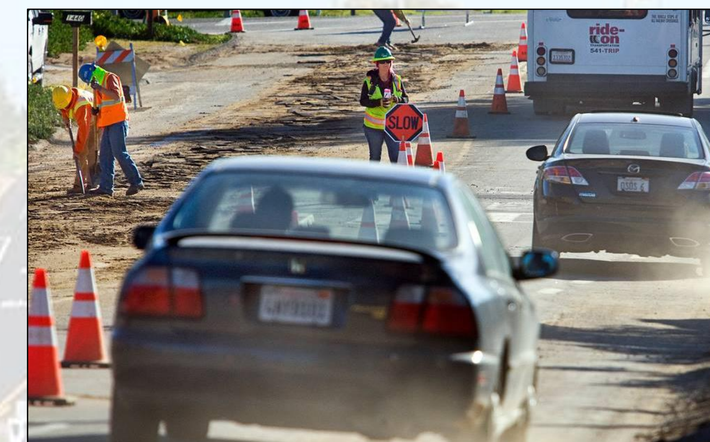
Public Infrastructure Projects