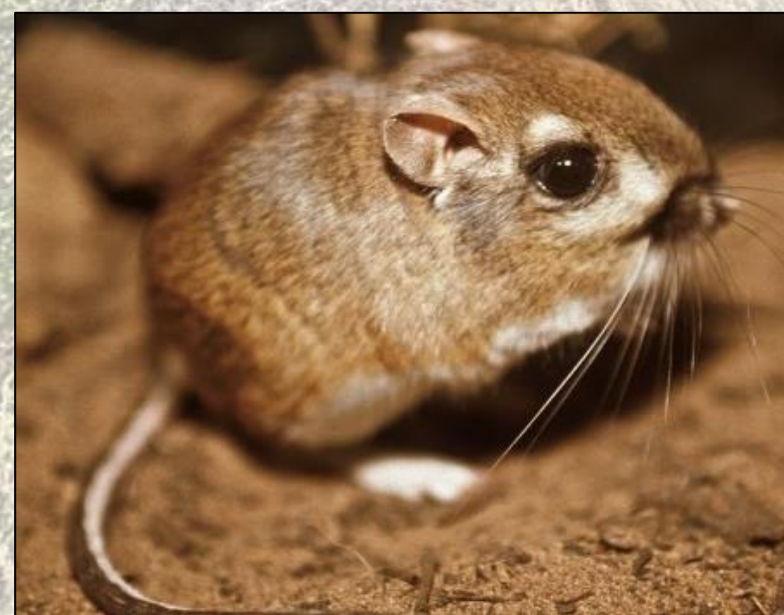
Morro Bay Kangaroo Rat