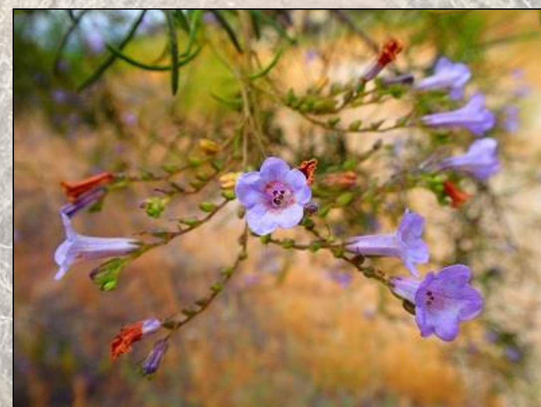
Indian Knob Mountainbalm