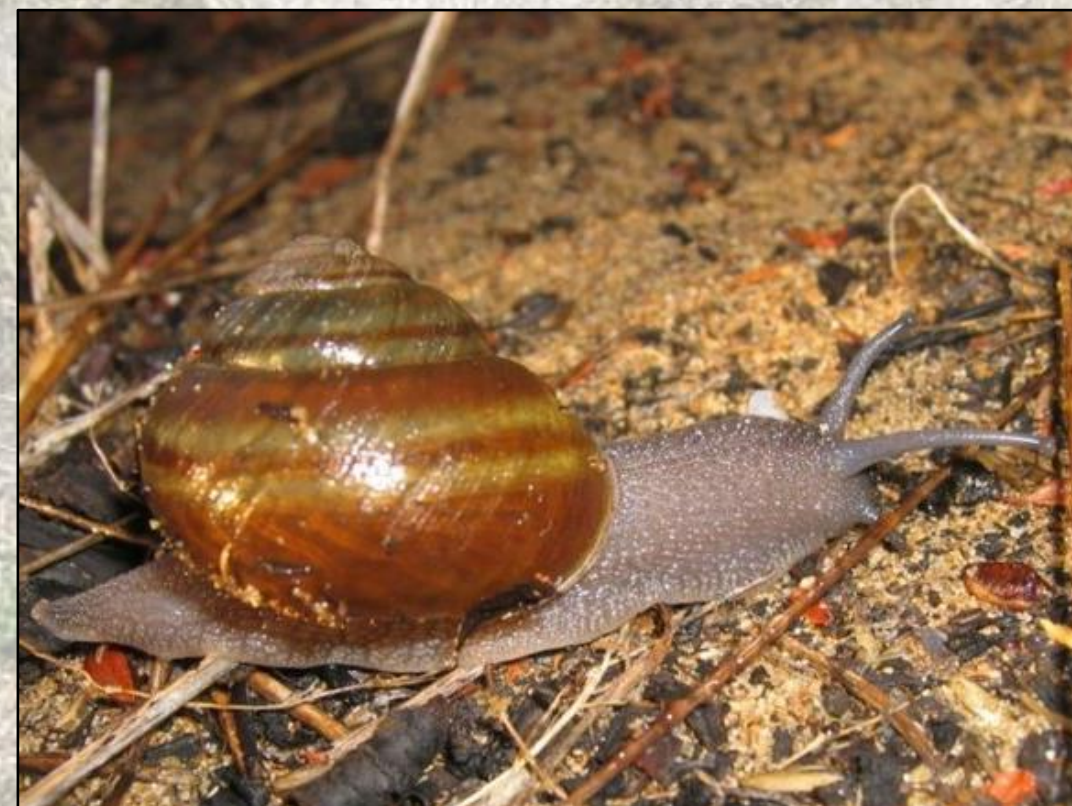
Morro Shoulderband Snail