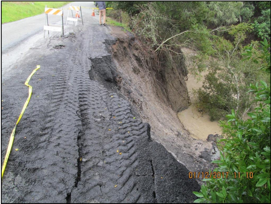
Photo 2. Cayucos Creek Road MP 2.8