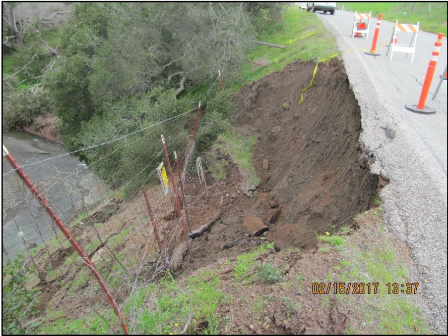
Photo 1. Cayucos Creek Road MP 1.2