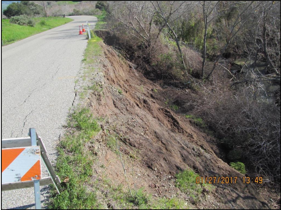
Photo 7. Toro Creek Road MP 1.9