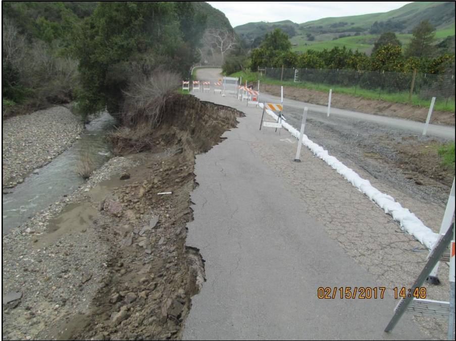
Photo 6. Santa Rosa Creek Road MP 4.9