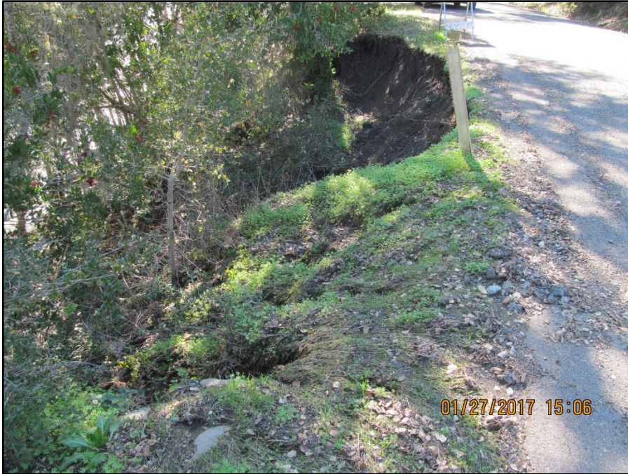
Photo 3. San Simeon Creek Road MP 4.4