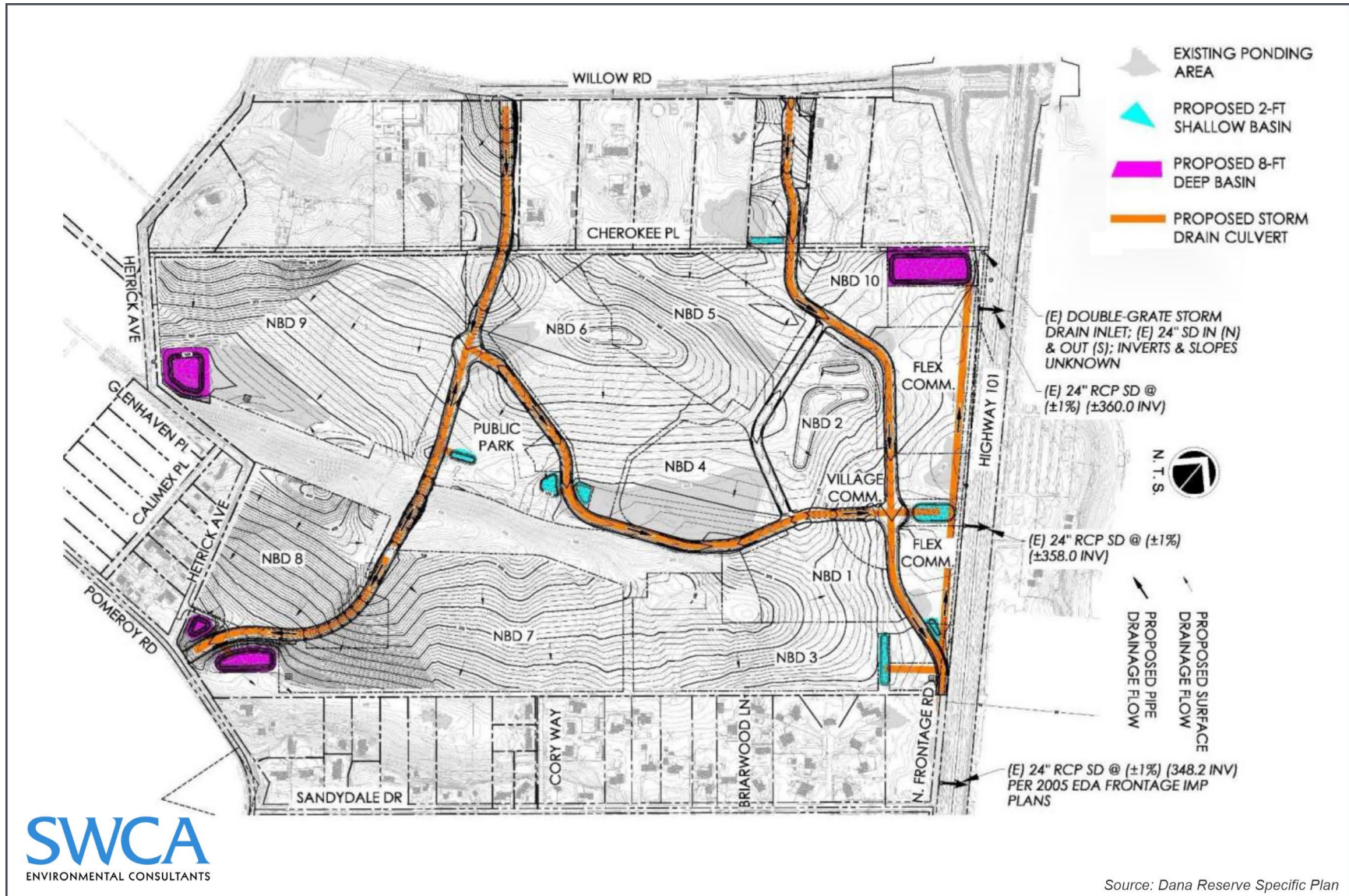
Figure 4.10-3. Proposed Stormwater Management Facilities.