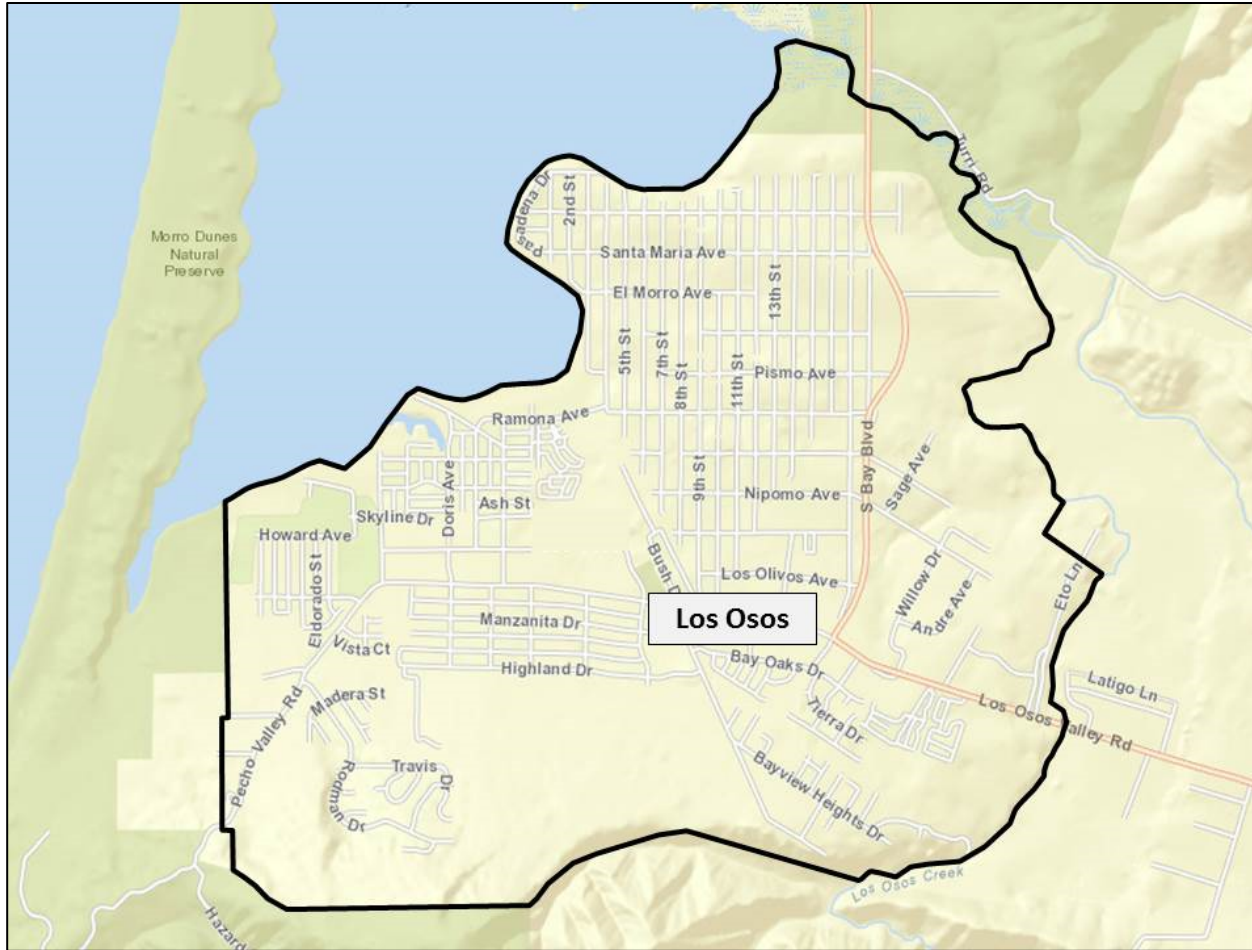
Figure 1-1: Los Osos Community Plan Area