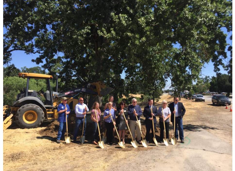
Templeton CSD Upper Salinas Conjunctive Use Project Groundbreaking Ceremony 6/8/2018