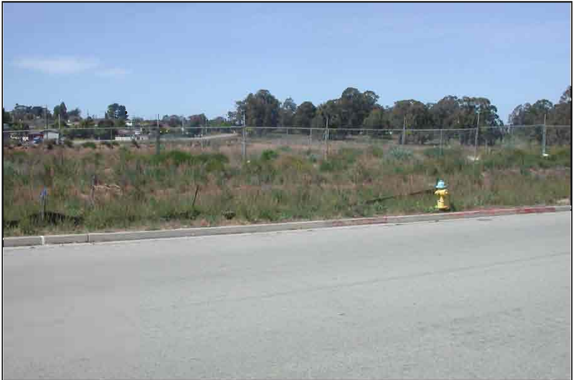
View of Mid-town site from Palisades Avenue facing west.