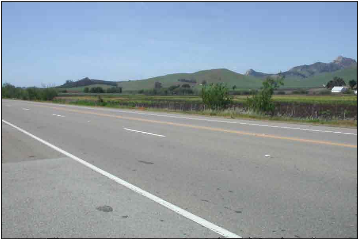
View of existing conditions on the Tonini parcel.