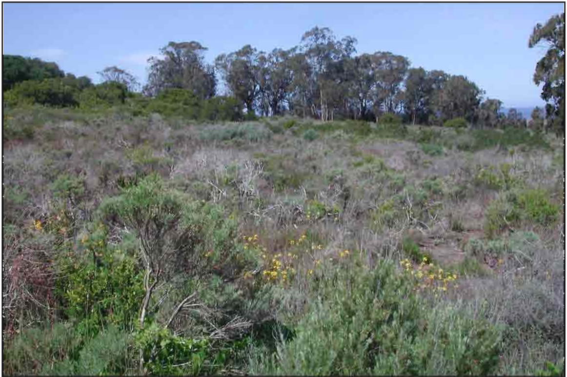
View of northern portions of the Broderson property, facing west.