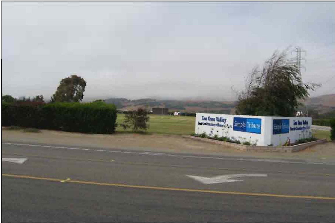
View of simulated treatment plant on Giacomazzi parcel.

Source: Michael Brandman Associates, 2008.