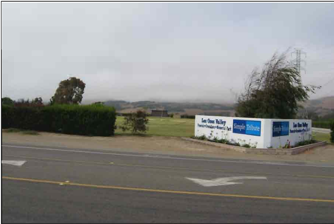
View of existing conditions on Cemetery, Giacomazzi and Branin parcels.