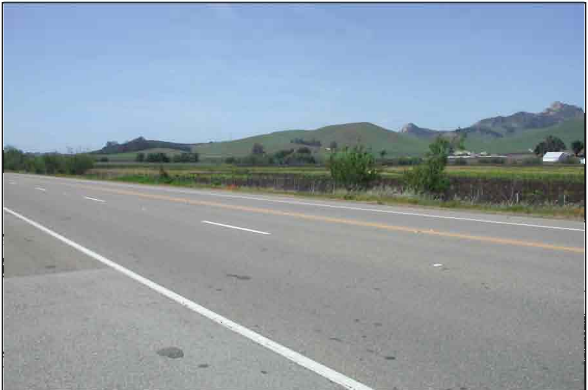
View of simulated treatment plant on the Tonini parcel.